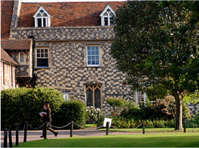
The Edred Wright Music School

The King's School in Canterbury is one of the oldest schools in England. Our brief was the acoustic design and commissioning of the new Edred Wright Music School. The project involved the creation of a recital room, a recording studio, music practice rooms, music classrooms and an orchestra rehearsal room as part of a renovation of 'The Grange', a 19 th century listed building previously used as a boarding house.