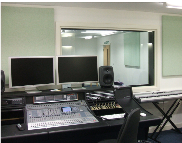
Basement Recording Studio

Some very carefully detailed lightweight constructions were developed to provide the sound insulation between studios and practice rooms on rather elderly timber floors. Close liaison between the design team, contractors and material suppliers allowed us to generate detailed layouts of acoustic treatment throughout the Music School to not only provide an excellent acoustic environment but an economical and aesthetically sensitive solution to the problems of providing modern, acoustically excellent facilities without losing the character of the historic building.